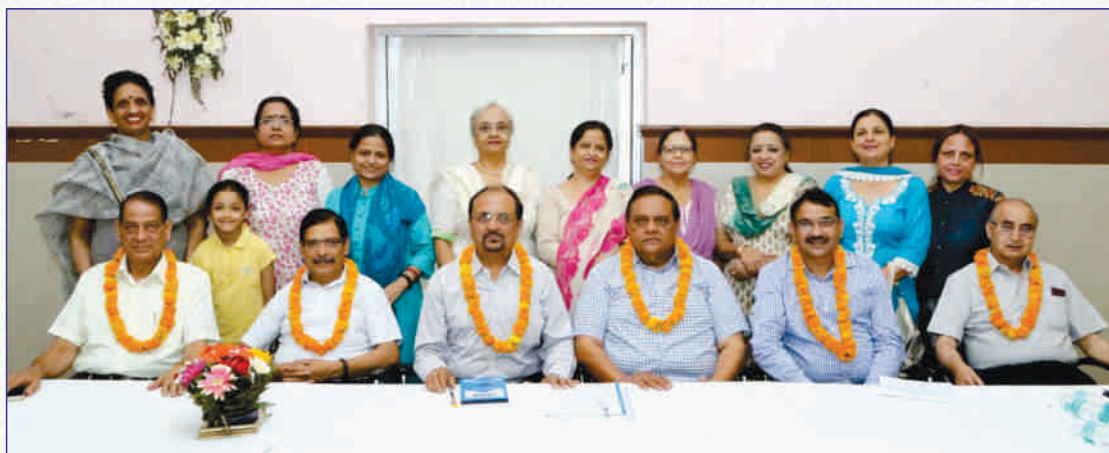
Newly elected committee with lady members of Sood Sabha