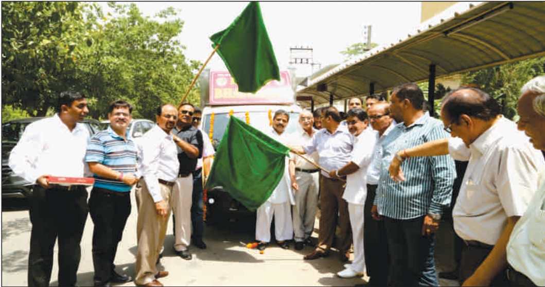
The Mobile Van was flagged off by Chairman SSBT and President, General Secy. of the Sood Sabha.