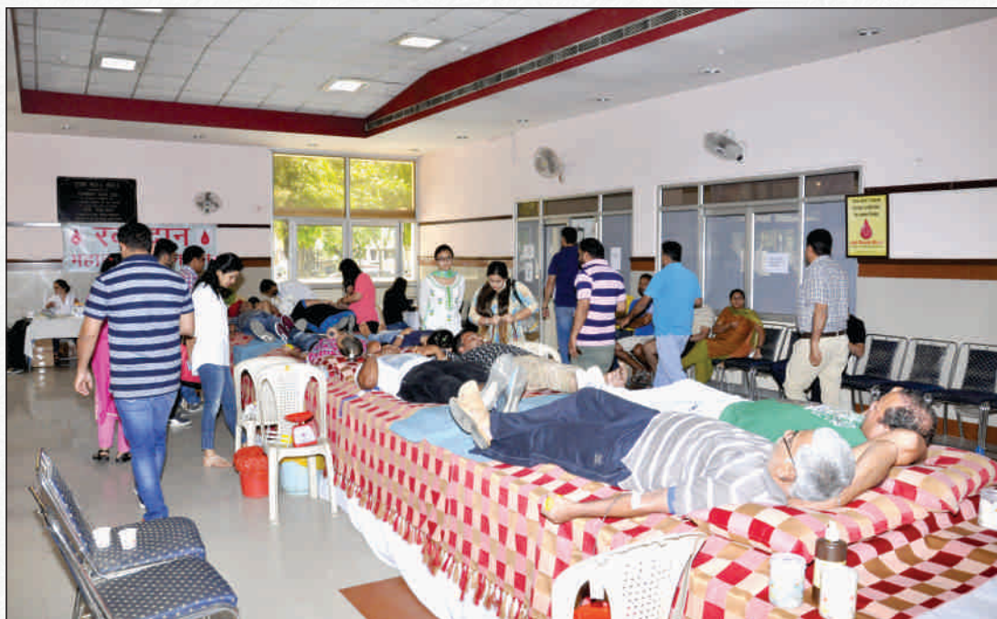
A view of the camp.