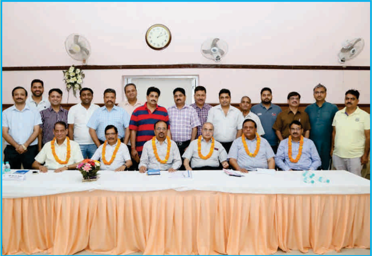
Members of Sood Sabha with newly elected President, General Secretary and Secretary (Finance).

• Sood Sandesh ₹ 500/- (Membership for ten years)