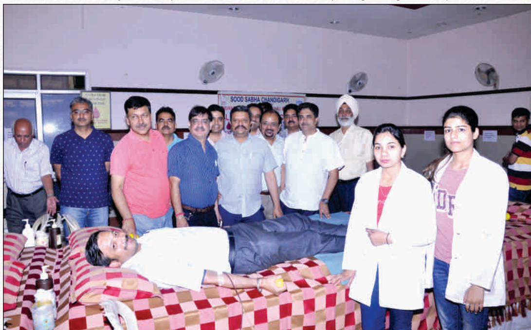
Members of Sabha with a member donor