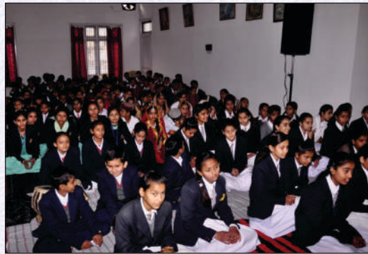
View of audience