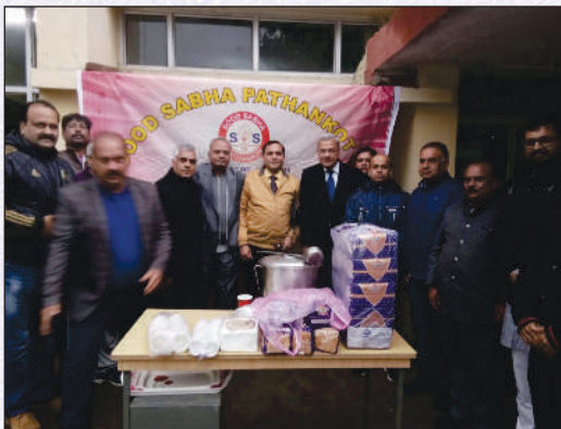
Sood Sabha, Pathankot