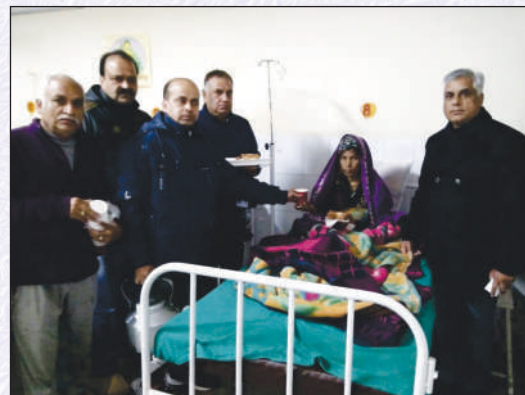
Distributing fruit to patients