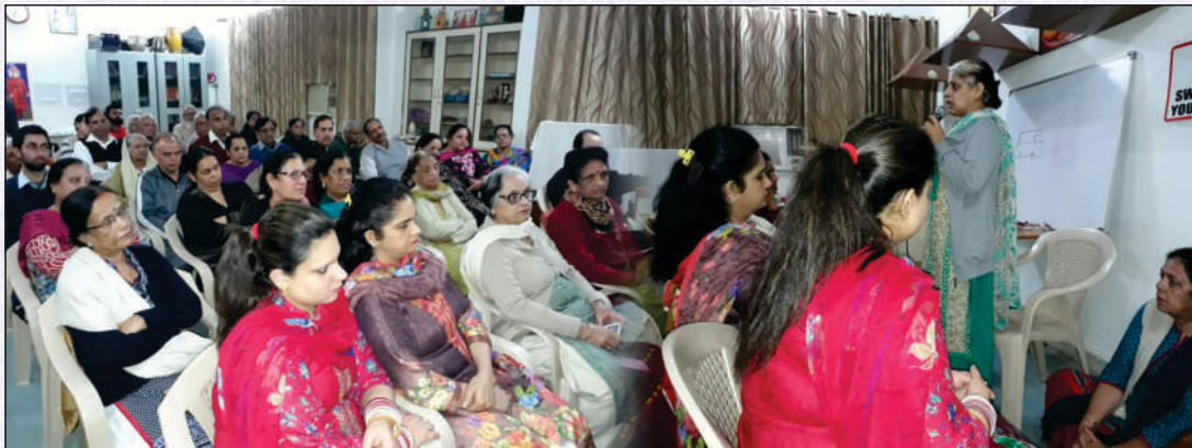
A meditation session arranged for public at Sood Bhawan, Chandigarh