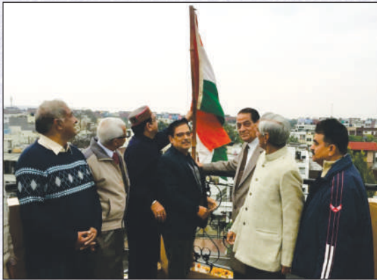
President & Members of Sabha celebrated Republic Day at Sood Bhawan, Panchkula

उपर्युक्त Slogan सूद सभा, चण्डीगढ़ द्वारा बनाया गया व लोगों से स्वच्छता के बारे में जागरूकता लाने के लिये शहर में विभिन्न स्थानों पर बैनर लगाये गये ।