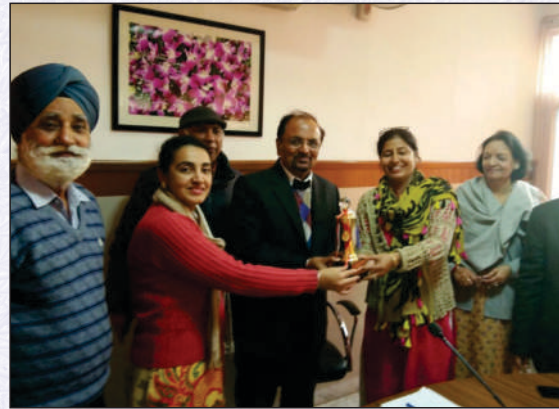
Resident Welfare Association Sect. 44A presented a memento to the Gen. Secy. of the Sabha for rendering excellent service to the Community