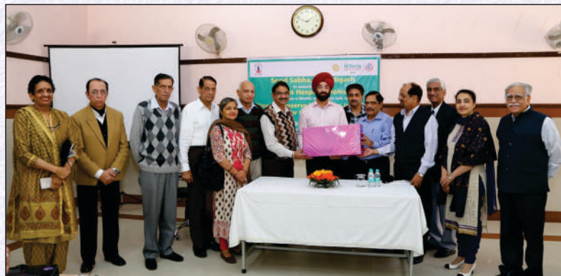
A memento being presented by Sood Sabha