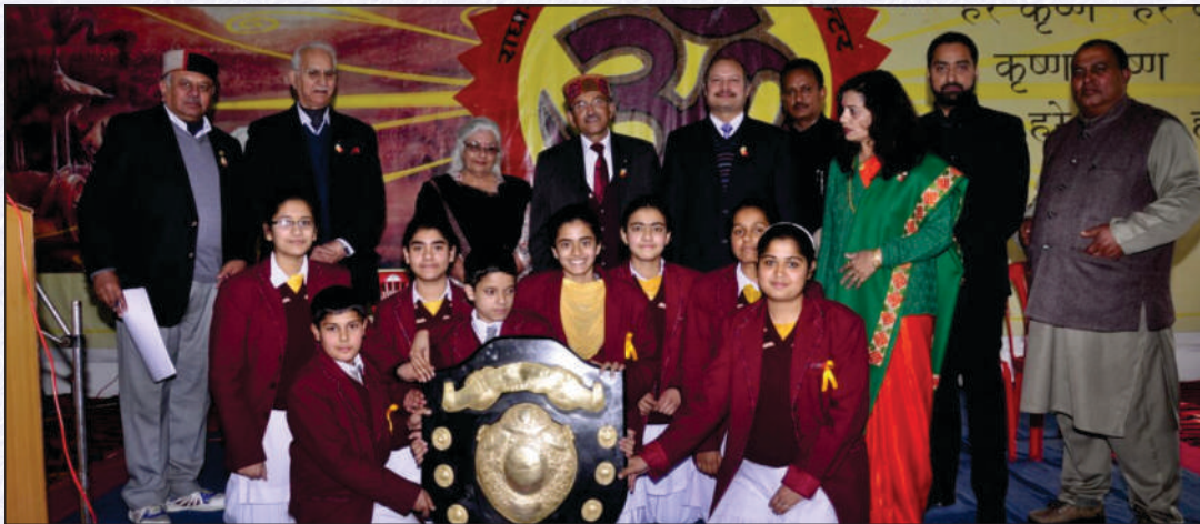
Smt. Kamlawati Sood Memorial Bhajan Competition organised on 4th February, 2017 at Dehra (H.P.)