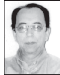
Dr. J.K. Kalra Sood Bhawan, CHD

Make sure you get your blood pressure checked regularly and treat it the way your doctor advises.