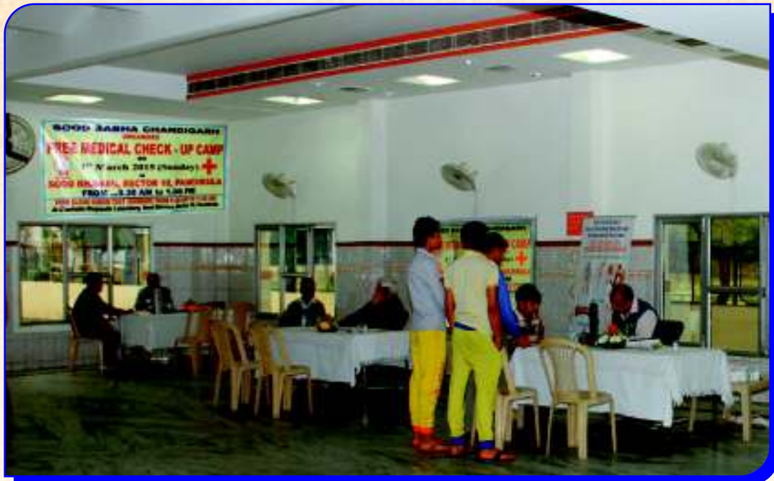
Sood Sabha, Chandigarh organised a Free Medical Check-up Camp, at Sood Bhawan Panchkula on 1st March, 2015