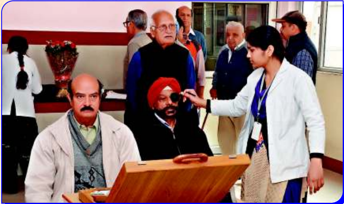
A free Eye Check-up Camp in process