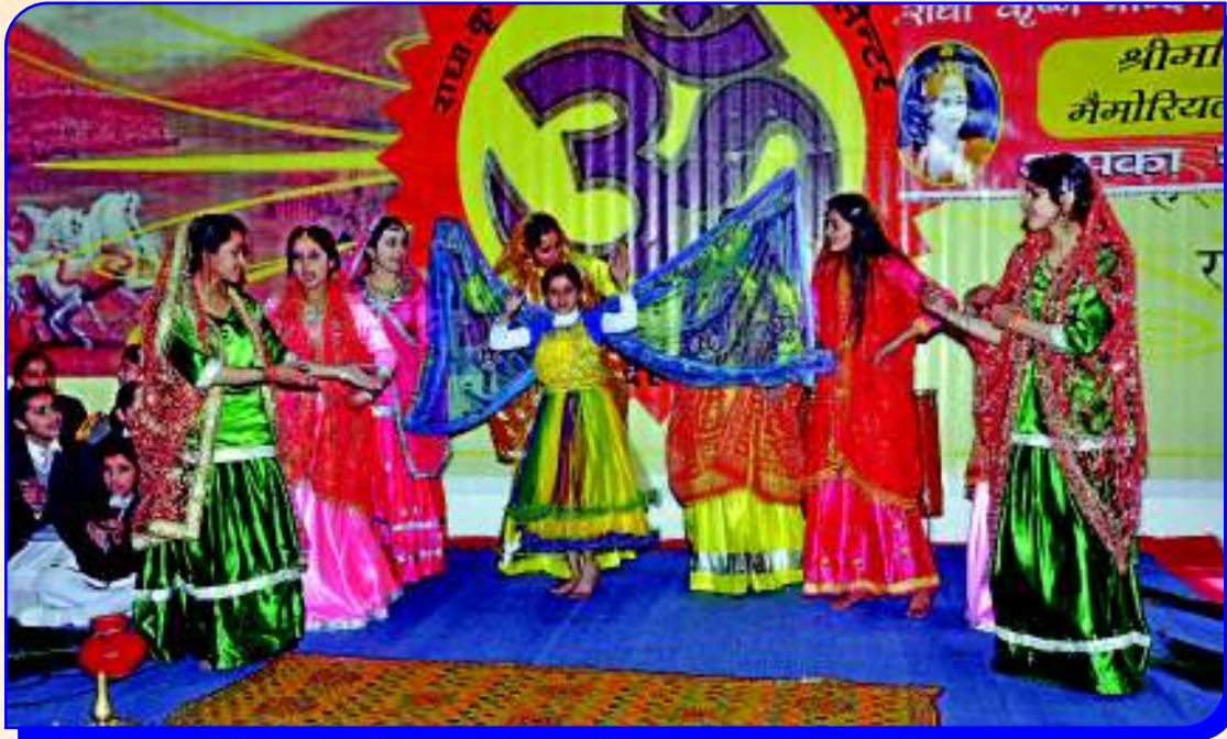
Girls from local school presenting a dance item