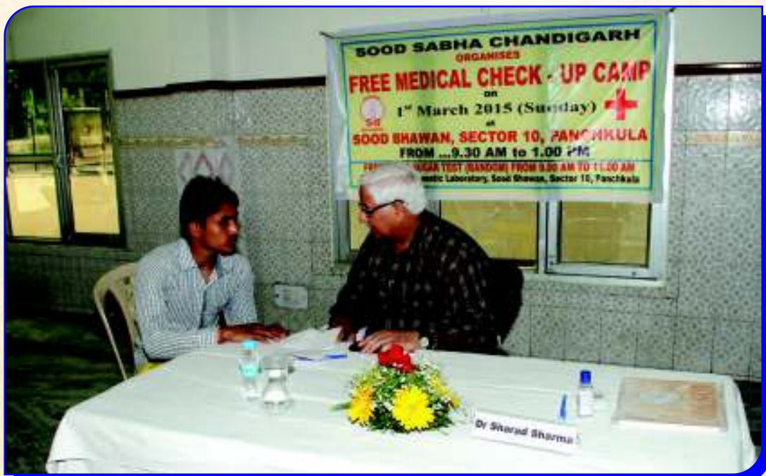
Patient being examined in the Free Medical Check-up Camp