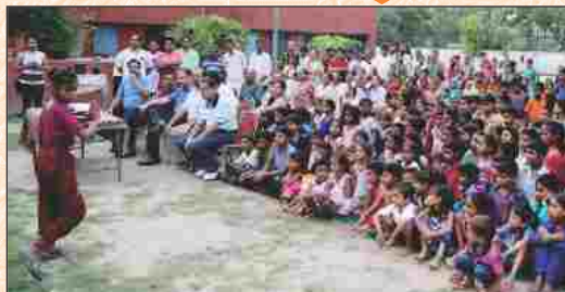
at Village Dhakoli