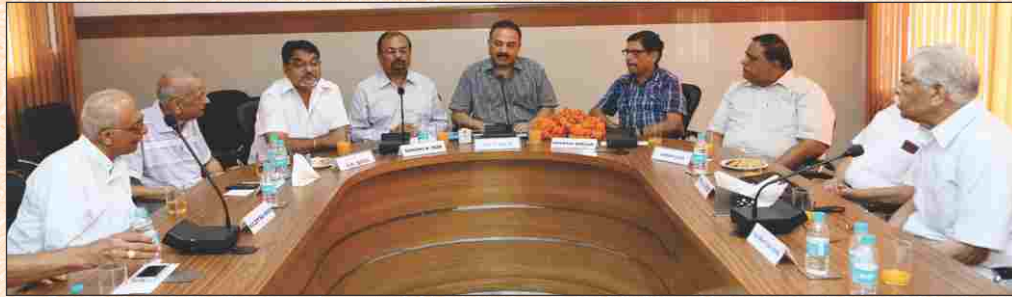
Mayor, Chandigarh addressing the Executive Committee Meeting of the Sabha.