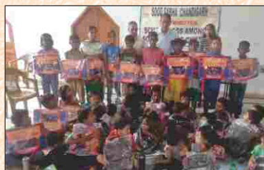
Jain Sathanak Mandir, PKI