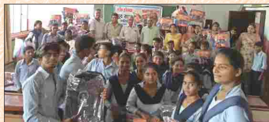
at Bapu Dham Colony