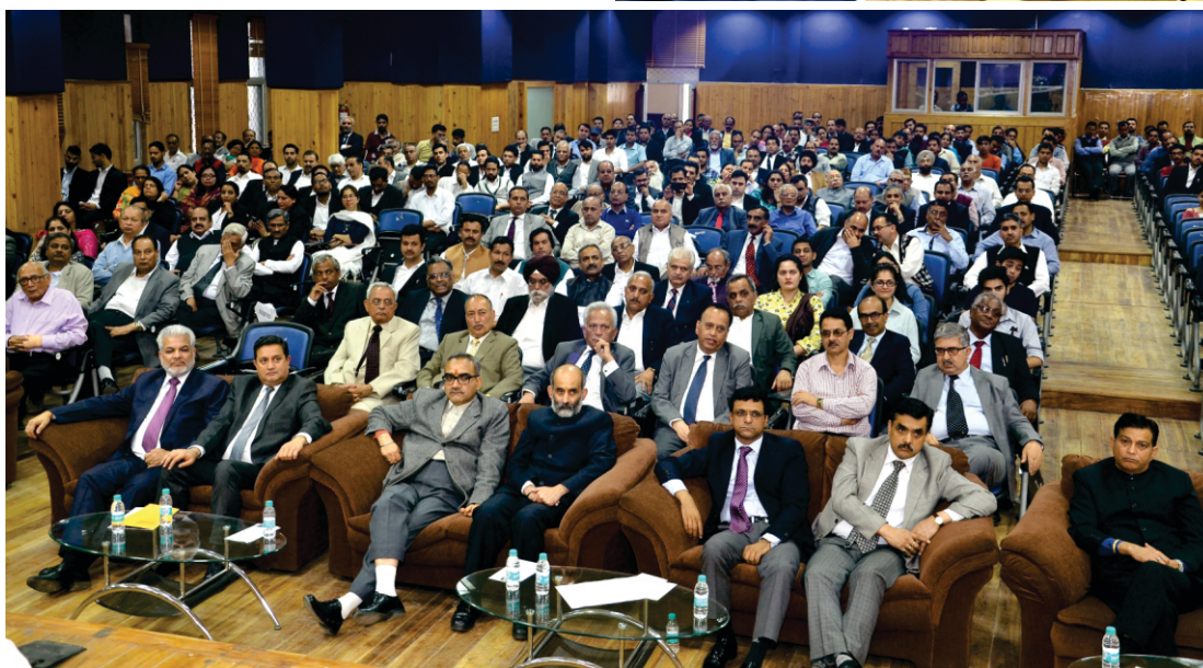
View of the Audience