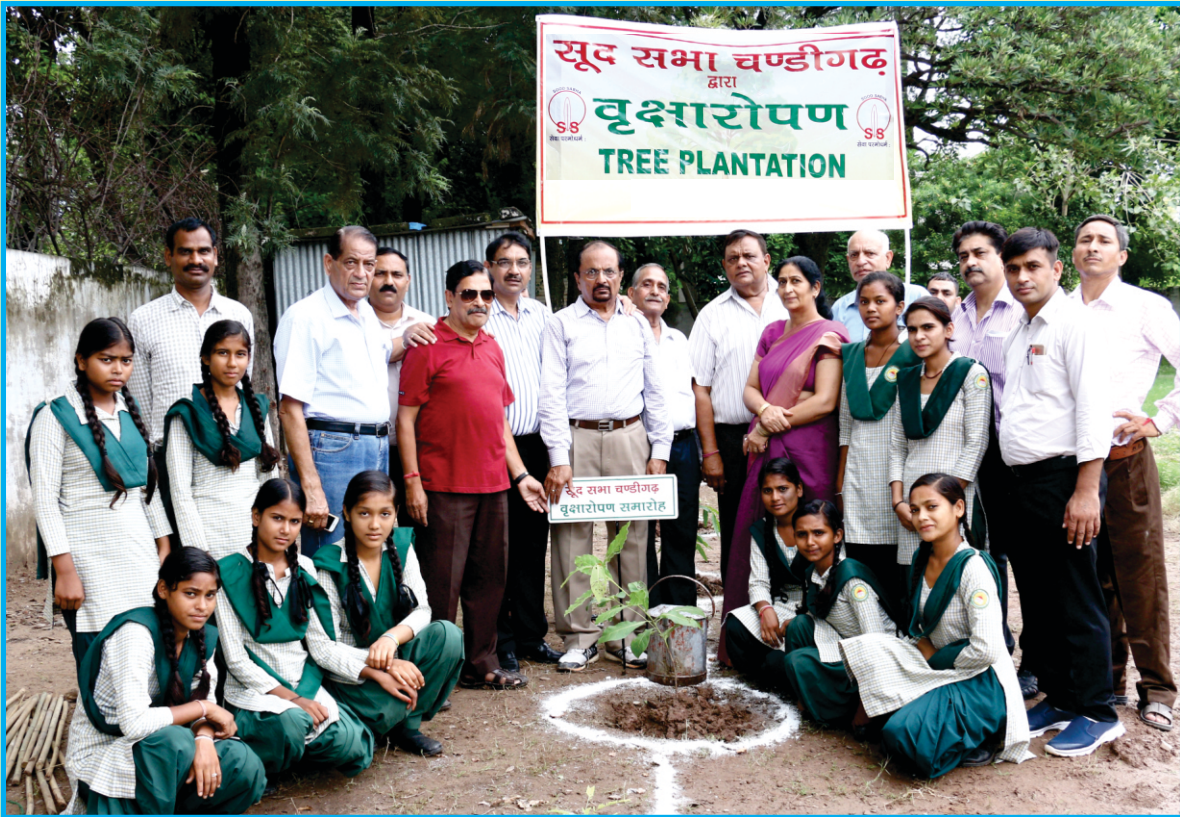
Sood Sabha Chandigarh launched “Tree Plantation Campaign” at Govt Sr. School, Sector-6, Panchkula

• Sood Sandesh ₹ 500/- (Membership for ten years)