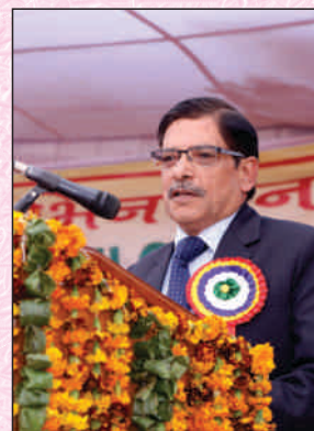
President Sood Sabha