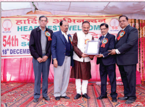
Honouring the Chief Guest