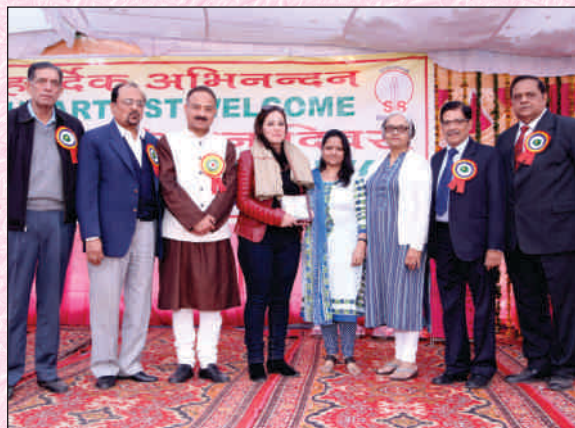
Honouring the wife of Chief Guest