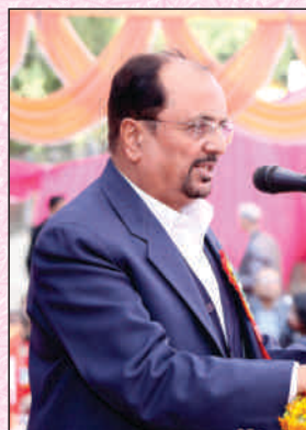
General Secretary Sood Sabha