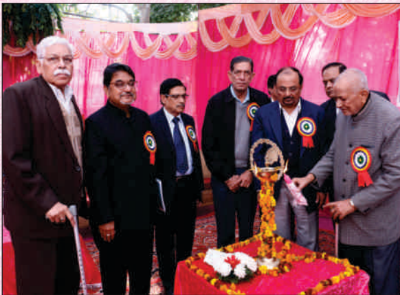
Lighting the inaugural lamp