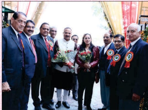
welcoming Chief Guest