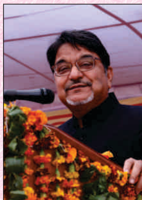
Chairman Sood Seva Bhawan Trust