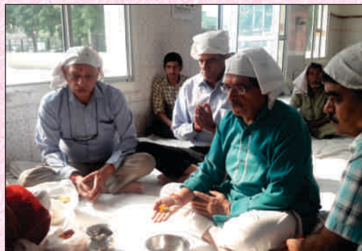
Sood Bhawan, Panchkula