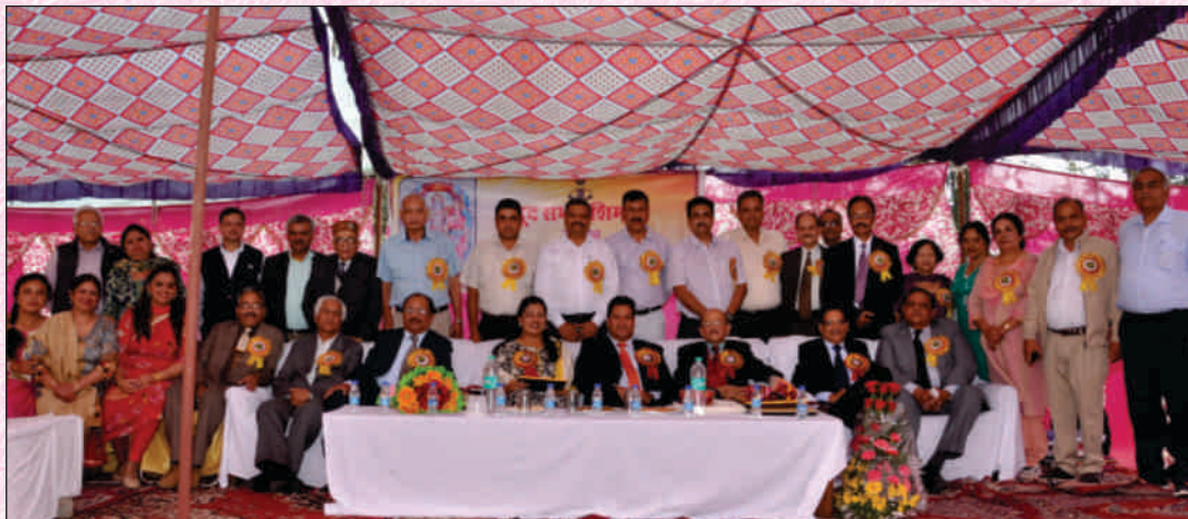
Sood Milan Mela of Sood Sabha Shimla on 25th September, 2016