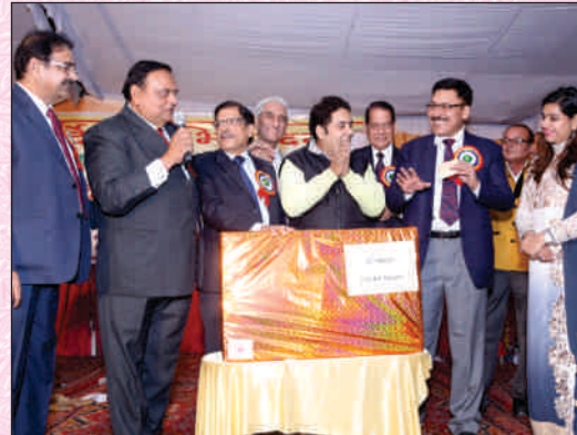
Lucky Draw, Winners