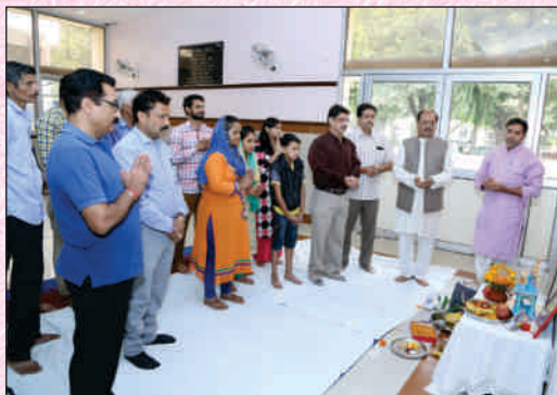
Sood Bhawan, Chandigarh