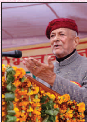
President Sarvadeshik Sood Sabha