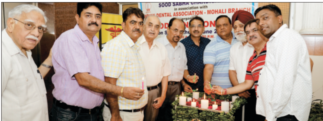
Members of Sood Sabha lighting the inaugural candles.