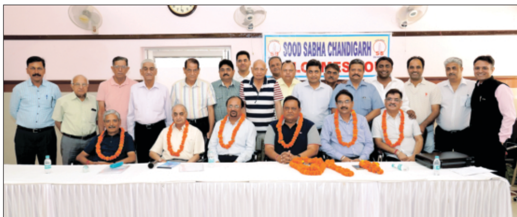
↑ Office bearers of Sood Sabha with Patrons, Executive members & lady members ↓