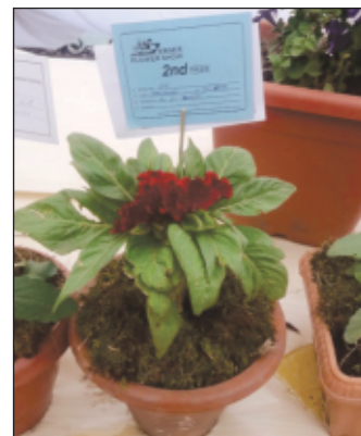
Sh. Kapil Dev Sood, Sr. Advocate Shimla bagged many prizes in flower show arranged by Shimla Amateur Garden & Environment Society at Shimla.