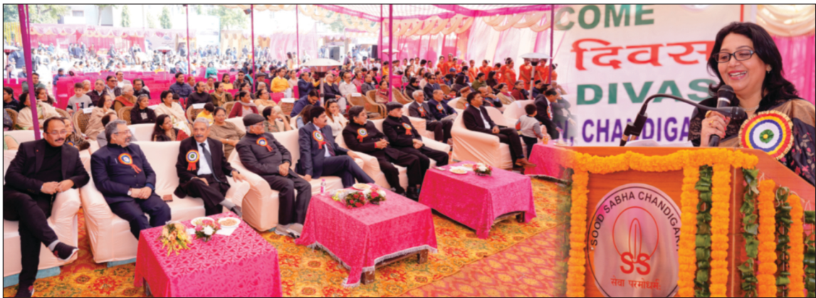
A panoramic view of audience.