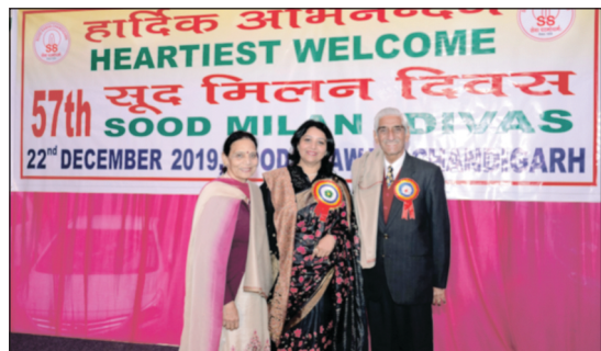
Felicitating Golden Anniversary Couple