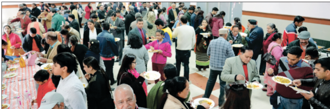
Lunch in progress