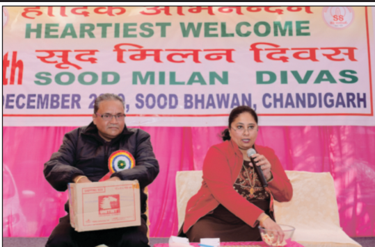
Tambola in Progress