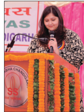
Our Compering Team