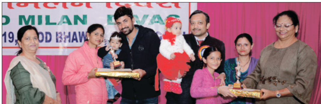
Sood Prince & Princess