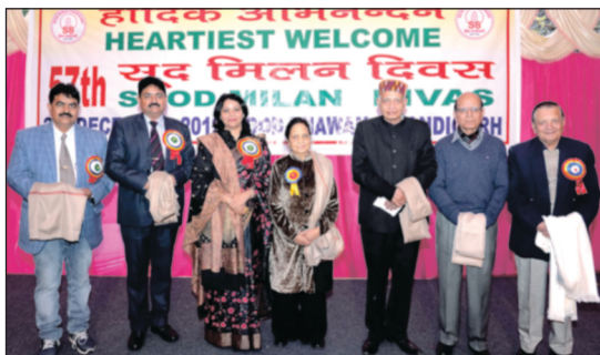
Honouring Senior Biradari Members (above 80)