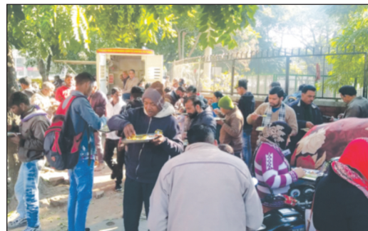
Langar Sewa at Civil Hospital Manimajra