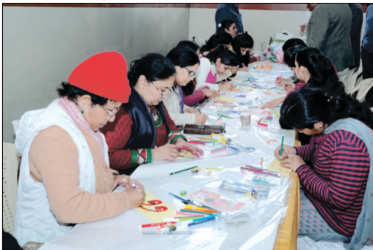
Envelop Decoration Contest