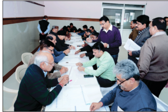
Button Sticking Contest