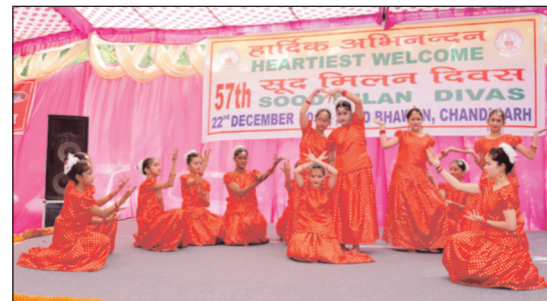
Performance by students of Aanchal International Public School.