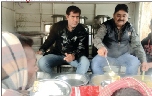
Langar Sewa by Sood Sabha, Chandigarh