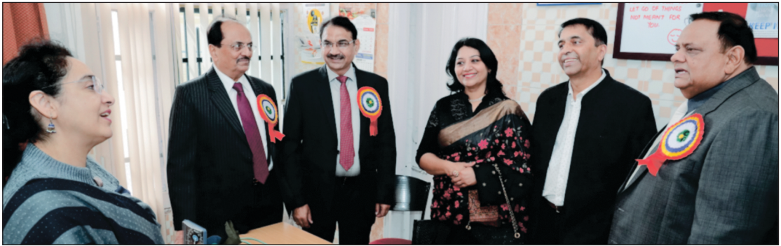
Chief Guest visited Pathology Lab, Physiotherapy and Homeopathy Dispensary