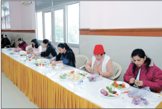
Salad Dressing Contest