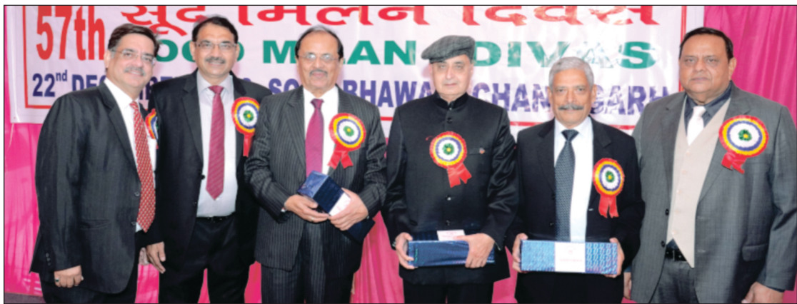
Honouring of Patrons of Sood Sabha, Chandigarh