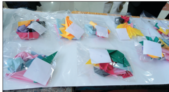
Paper Folded Displayed