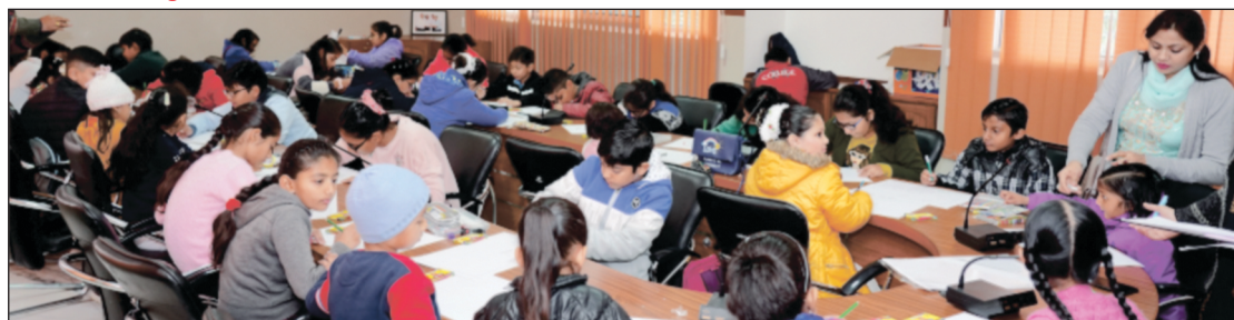
On the spot Painting Competition