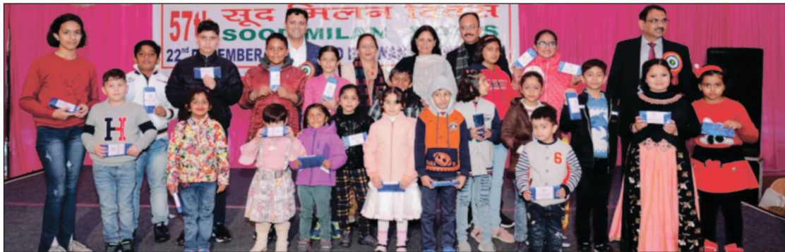
Cultural Programme Participants