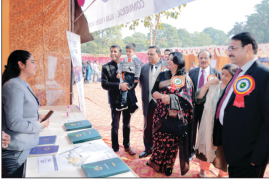
Chief Guest having a round of Stalls