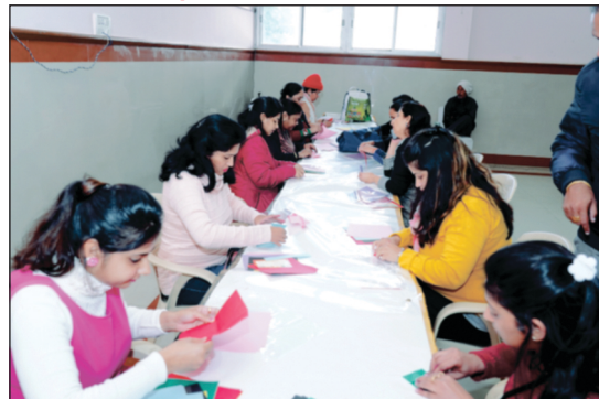
Paper folding Contest